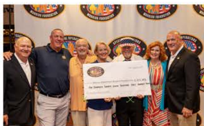
Annual SOWF Event details on page 6