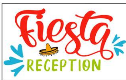
Fiesta Member Reception details on page 3