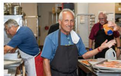
Member Staff Classic details on page 5